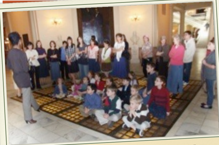
AT THE GEORGIA STATE CAPITOL

A MINISTRY OF BEREAN BAPTIST CHURCH, LILBURN, GEORGIA