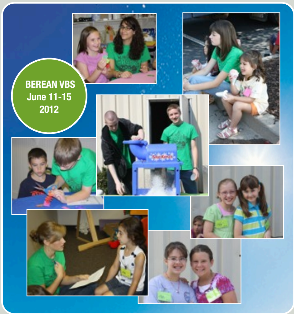
BHG Homeschoolers at the Berean Vacation Bible School 2012 Younger homeschoolers attended the VBS, while older homeschoolers, together with other Berean church members, assisted teachers in classes, organized games and activities, managed snack stations, and gladly served the Lord in various ministry capacities.